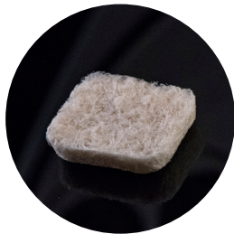
100% bone fibers