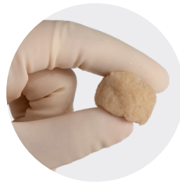
Moldable upon rehydration