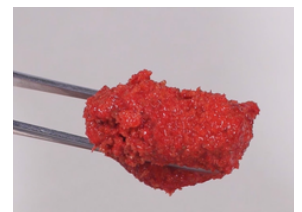
Simulated autograft mixed with PliaFX Prime

Speak to your local Business Development Manager, for further information using the details below: